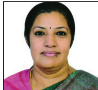
Smt. Daggubati Purandeswari