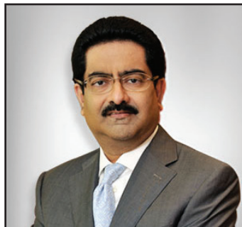
Shri Kumar Mangalam Birla