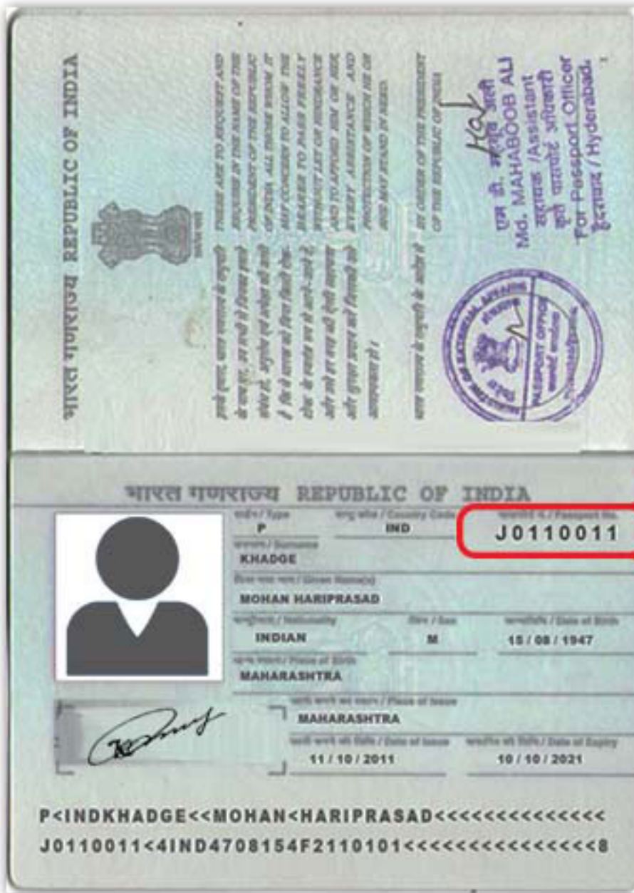
First two pages